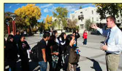
UNM Campus Tour

tour of the University of New Mexico, the AISES Pre-college Track with other high school students, and the prestigious AISES Career Fair, the largest career fair in Indian Country.