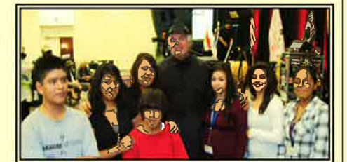
Actor/Performer Gary Farmer

ticipate in various workshops held at the main conference.