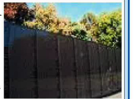
Veteran's Memorial Wall