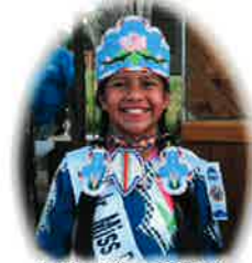
Junior Miss, 2010-11 Aurora Toledo