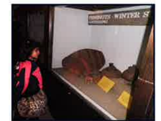
Enjoying the Exhibits