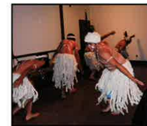
Owens Valley War Dancers